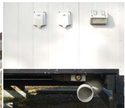
Power, Water and Sewerage Connections