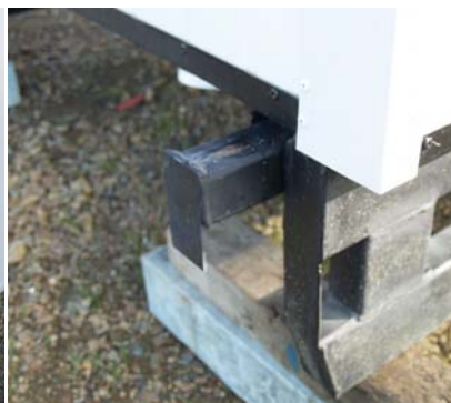
Crane Lifting Hooks