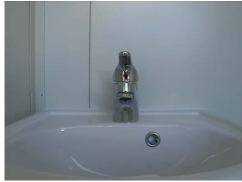
Quality Fittings : Basin Mixer